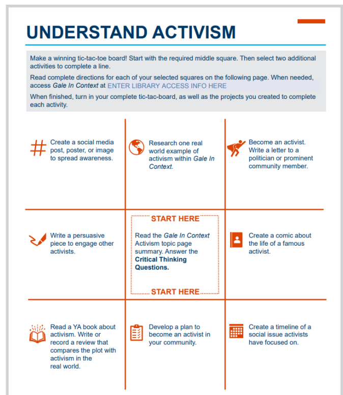
Activism Tic-Tac-Toe Activity

For additional information reach out directly to your Customer Success Manager at Gale.CustomerSuccess@cengage.com or Sales Consultant through support.gale.com/repfinder .